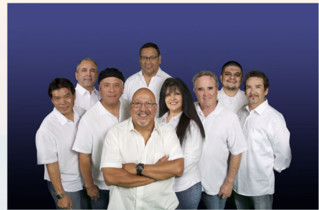
Cold Duck, 70s/Top 40s